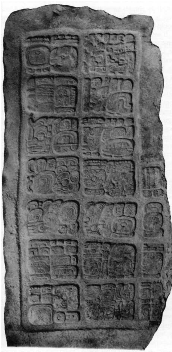
Fig. 9. Structure 44, Step IV. From Graham (1982).

faces is done with great delicacy of line. The use of double outline and fine crosshatching contributes to the beauty of the sculptures and unifies the images on the three lintels.