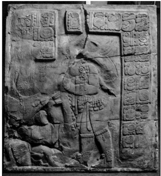
Fig. 3. Lintel 46. From Graham (1979).

The results of this study indicate that during the Late Classic period (A.D. 650-800), Yaxchilán rulers employed a large group of scribes, artists, and sculptors, most of whom worked in collaborative workshops. The analysis provides initial insights into some questions such as, what was the working relationship among contemporary artists? Is there evidence for workshops? Were scribes also the artists or designers of the monuments? Were the artists also the sculptors or were the sculptors illiterate craftsmen? What was the process of creating a monument? And finally, what are the specific details with which we can distinguish the hand of a Yaxchilán artist? In the course of this paper, I will offer tentative answers to all these questions, based on case studies of two sculpture ensembles commissioned during the reign of Shield Jaguar the Great.