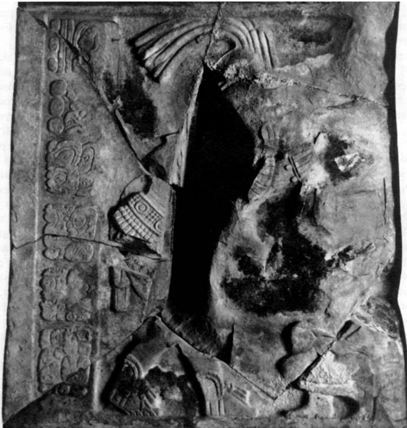
Fig. 1. Lintel 44. From Graham (1979).

Both these authors considered only the figural portion of the monuments in their analyses, ignoring the style of the hieroglyphic texts. I looked at the template figures and found too little evidence for proposing the hands of artists. Only when I began to examine glyphic handwriting, which is much less homogenous than the figures, was I able to identify scribes through scrutiny of traits such as slant, control of margins, general shape of glyphs, quality of line, kinds of outlines, handling of three-quarter view, surface treatment such as crosshatching and dotting, and characteristic spelling. Many of these diagnostic characteristics appear in the design and detail of figures as well. To become familiar with the hands of the artists at Yaxchilán, I studied all the known monuments, either the object itself or from photographs. Although many of the same traits are apparent