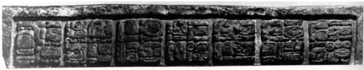
Fig. 10. Lintel 25. From Graham and von Euw (1977).

The problem of whether the Elegant Knot Artist, the Lintel 25 Artist, and the Exuberant Scribe also carved the Structure 23 lintels may be impossible to resolve. What variation in sculptural style in the lintels can be discerned? Clearly, the cutting away of the background had to be the first stage of carving. Faced with flat shapes of stone