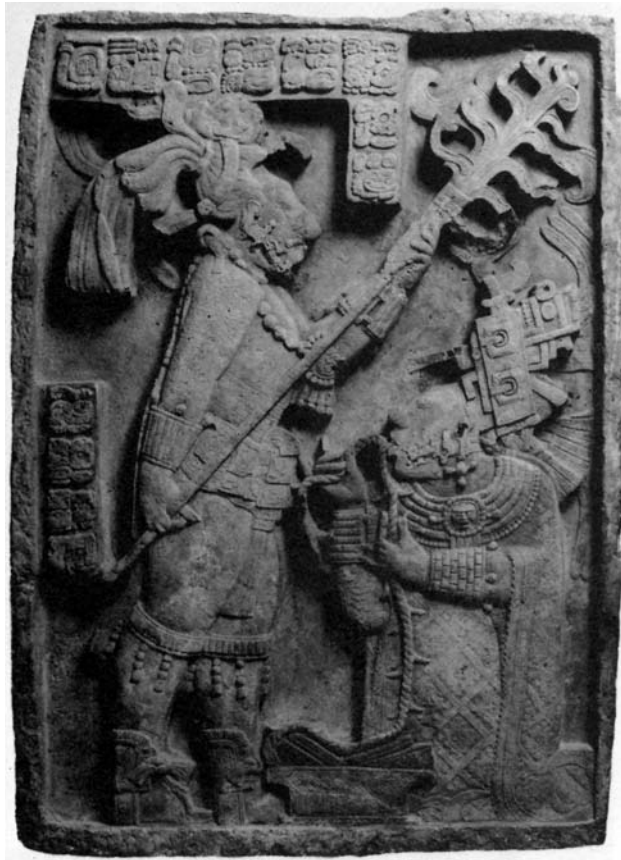
Fig. 5. Lintel 24. From Graham and von Euw (1977).