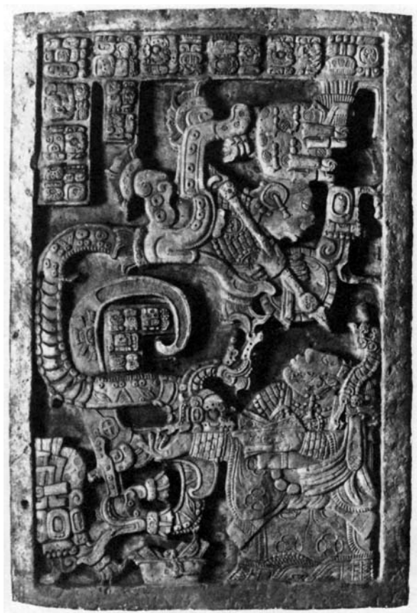
Fig. 6. Lintel 25. From Graham and von Euw (1977).

has a k'a "remembering" statement as well (at F8 on Lintel 46 and at C6 on Lintel 45). Indicative of a separate hand is the treatment of the smoke above the fist. The two statements are designed with substitutable variables, which perhaps indicates that the composition of words on the trio of lintels was orchestrated by an overseer who made sure that statements were not repetitive. Again, specific differences in glyph form, composition, and "spelling" indicate that the glyphs were drawn by two separate hands. Without laboring over the details, the Lintel 44 text appears to have been drawn by a third hand. But which scribe, if either, was responsible for the drawing of the figures?