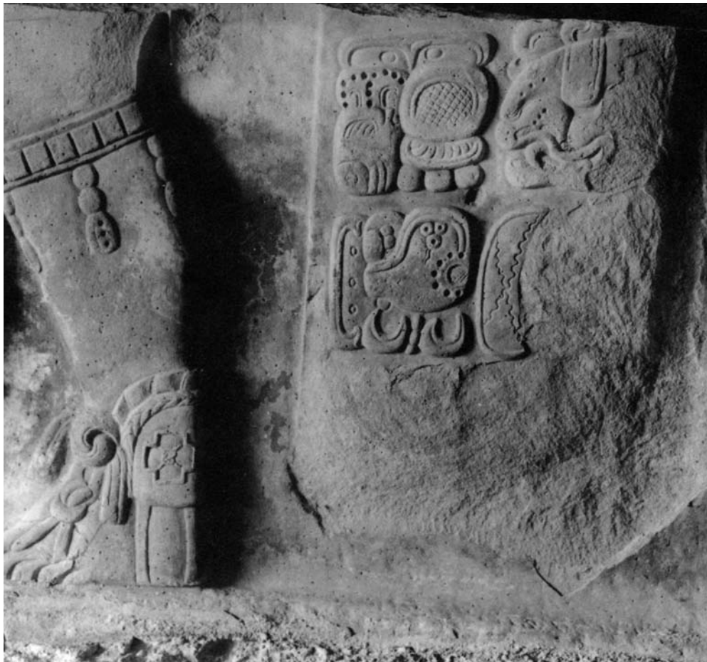
Fig. 4. Lintel 46, detail. From Graham (1979).

Despite damage to the Lintel 45 text, some specific syllables and words are common to it and Lintel 46 and can be compared. The u 's (T1) on Lintel 46 are very similar to those on the left text of Stela 12: the bracket forms the center projecting element in a continuous line, and the ovals are delicately small and are modeled to be quite separate from the bracket. In contrast, the T1s of Lintel 45 (at A2 and C6) almost look like half of a k'in sign. Comparing the skull variant u on both lintels, the one on Lintel 46 (at G7) has two holes in his cranium, a ridge at the nostril, teeth, and a single crosshatched suffix. The Lintel 45 skull (at C5) is summarily sketched in comparison. Each lintel