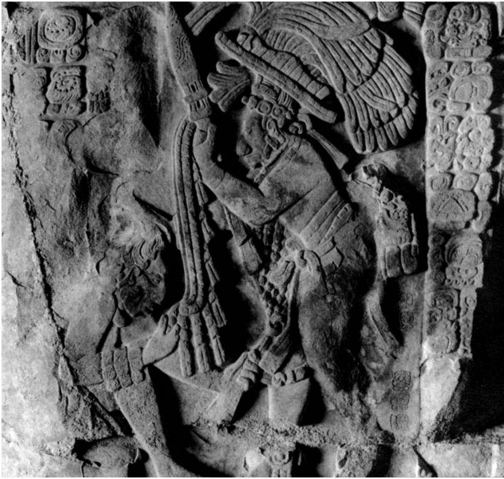
Fig. 2. Lintel 45. From Graham (1979).

in drawings, such aspects as roundness of edges and quality of the line cannot be studied through drawings.