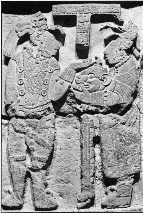
Fig. 7. Lintel 26.

indicates strands of hair throughout the length of each section of hair, whereas the Lintel 46 artist, on at least three occasions, indicates strands only at the end of the hair section. Therefore, despite the fact that on Lintels 45 and 46 the figures are similarly proportioned, the gestures are very similar, the subject matter is nearly identical, and the figures on both lintels are well observed, they were not drawn by a single individual. The work of the same three literate artists can also be seen on the next set of lintels carved at Yaxchilán. The Structure 44 lintels were completed on 9.14.5.0.0, and the Structure 23 lintels twenty years later, on 9.14.15.0.0.